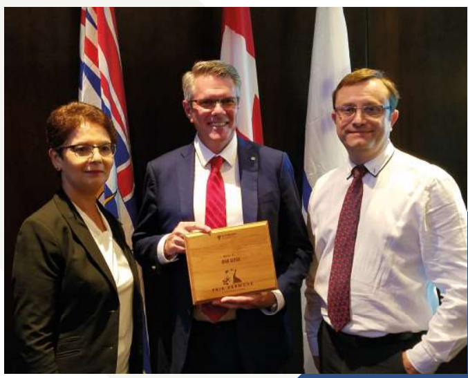
Kermode Award Ceremony, October 1, 2019