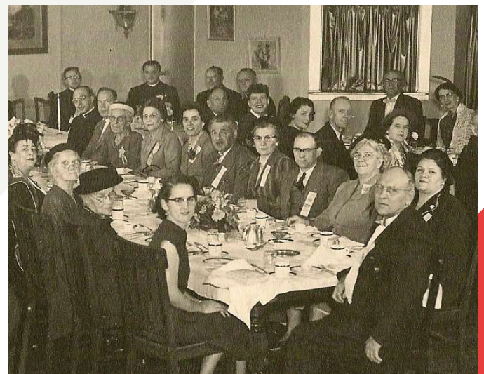
French-Canadian Federation of B.C. 10 th Anniv., 1948, in Victoria